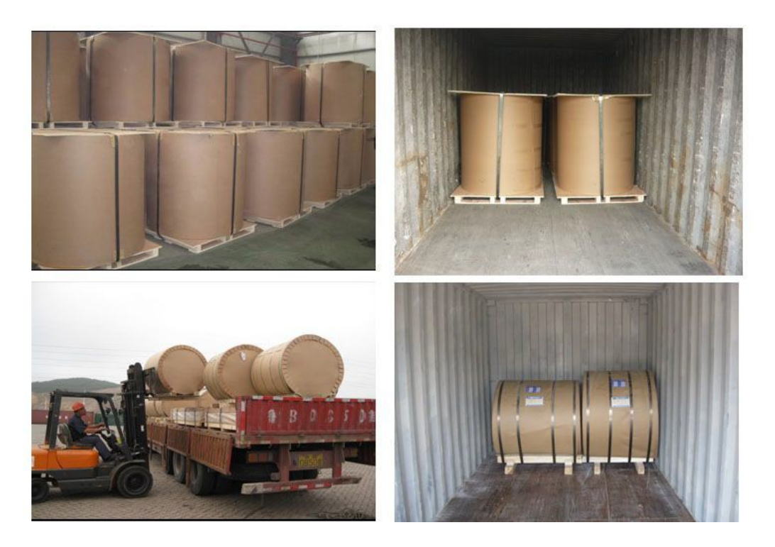
Production Process of Color coated aluminum coil

Every step significantly contributes to the excellent finished pre-painted aluminum coil, the pursuit of perfection spurs us on to our utmost effort to deal with every step as the following: